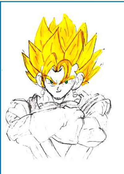
~Reyan Sadhwani (IV-Bluebell)