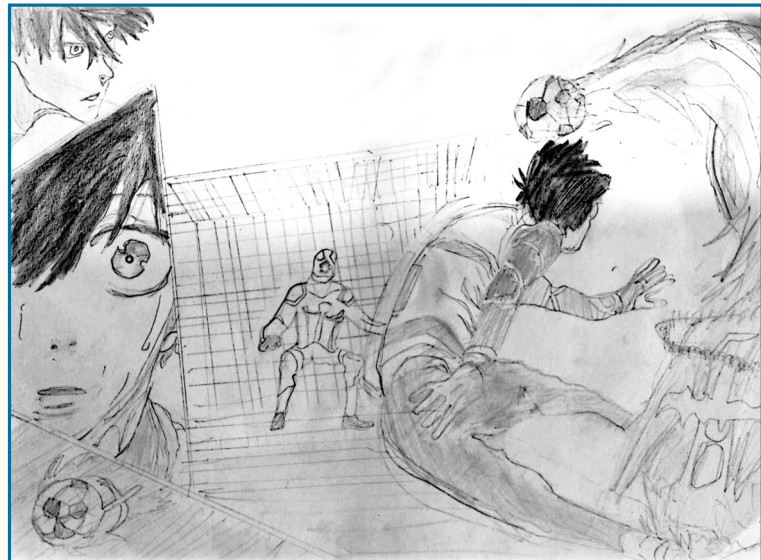
~Aayan Sadhwani (IV-Bluebell)